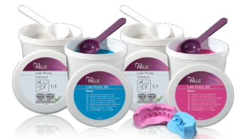
Pala® Lab Putty