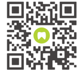
Pala® Dental Materials

BUY 30 Delara® Denture Teeth GET 1 Palaseal® (2x15ml) at NO ADDITIONAL CHARGE!