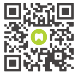
Pala® Dental Materials