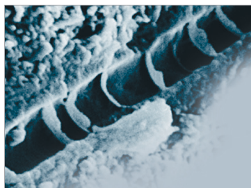
Protein septas following application of GLUMA