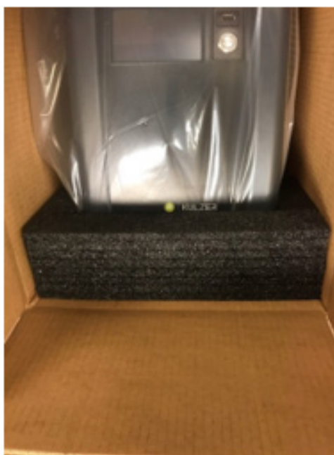
Foam at foot of printer