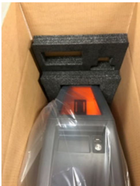
Foam at head of printer