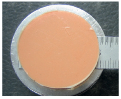
xantasil® shrinkage behavior after several weeks.