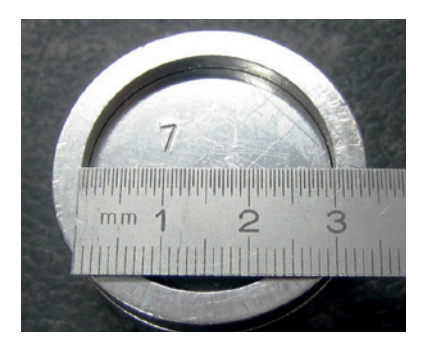
Reference form with ruler.