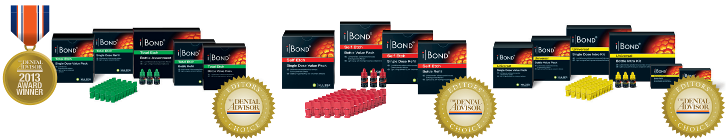
iBOND® Total Etch (Pg. 6)