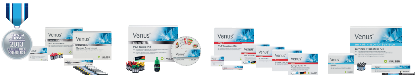
Venus Diamond® Flow (Pg. 6)